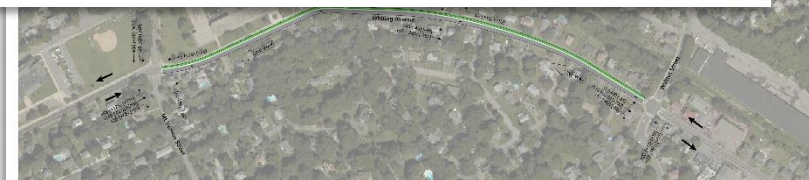
Alternative 1 - One-Way Whiting Ave Dedham Schools Dedham, Massachusetts