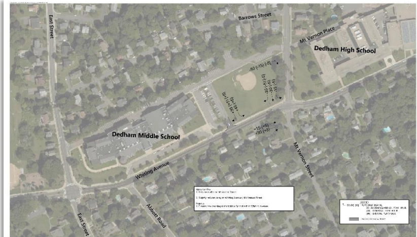
Alternative 5 - Middle School Connection to Whiting Avenue Dedham Schools Dedham, Massachusetts